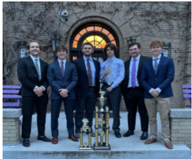
Fiji Racing Team with their Trophies, Apr. 2022

With one year under our belts, the Fiji Racing team looks forward to next year's Grand Prix and has a podium finish in sight.