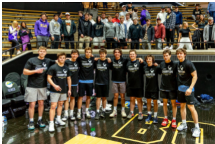
Spring 2022 3v3 Basketball IM Champions, Mar. 2022

The semester kicked off with 31 brothers attending the Mortar Board Leadership Academy, teaching them leadership skills necessary to follow in the footsteps of many great Lambda Iota's. A few